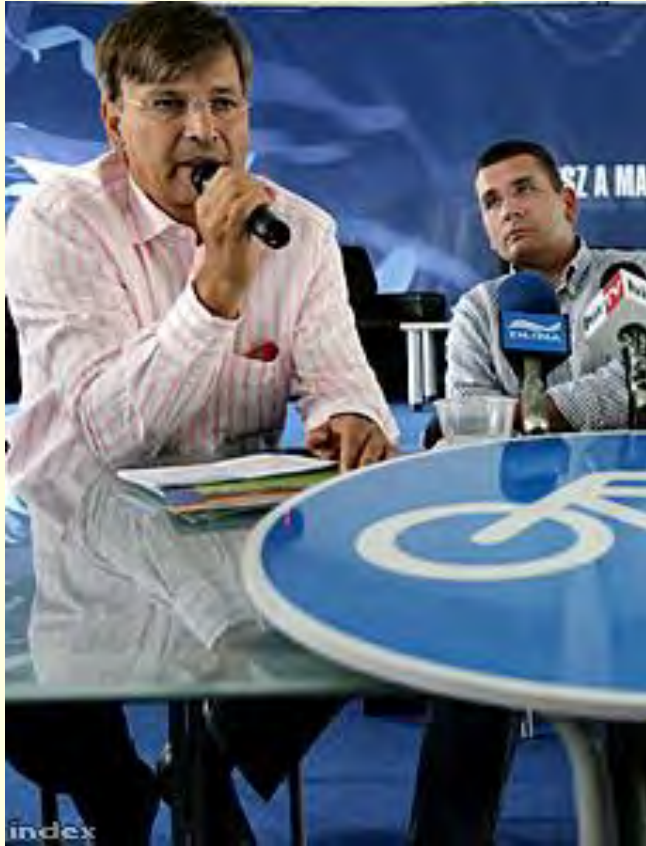
Former Mayor Gábor Demszky