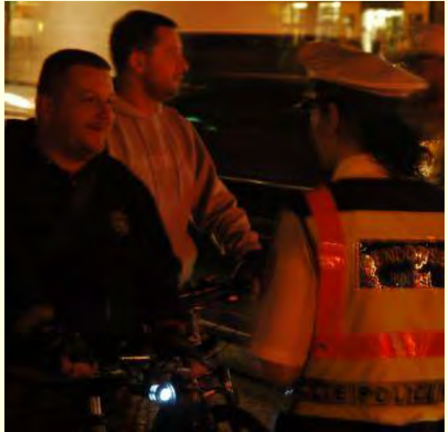
2010 Car-Free Day Critical Mass